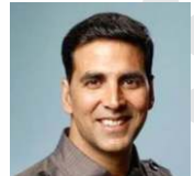
Akshay Kumar Bollywood Celebrity

“I am honoured to meet General Vijay Kumar Singh, the keyman behind the rescue mission operation 'Rahat' during the Yemen crisis.”