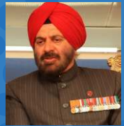
Retd. General J. J. Singh Former Army Chief

commented on Retd. General V. K. Singh's Autobiography, Courage and Conviction