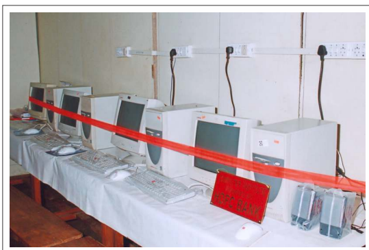
Setting of Computer Center at the adivasi school, computers donated by HDFC Bank.