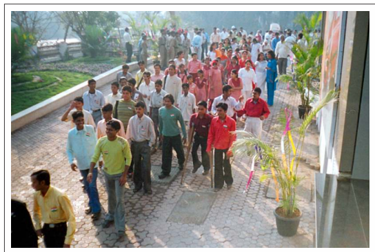
Children gathered at the Republic Day function - 2005.