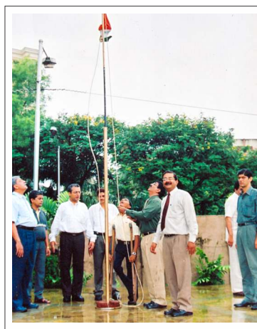
Flag salutation by an handicapped child on the Republic day - 2005