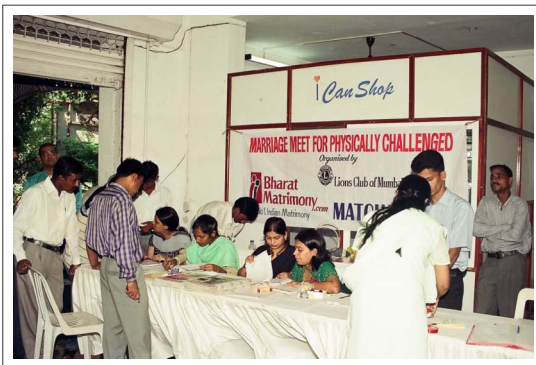
Registration counter at the Marriage Meet arranged for the Physically challenged.