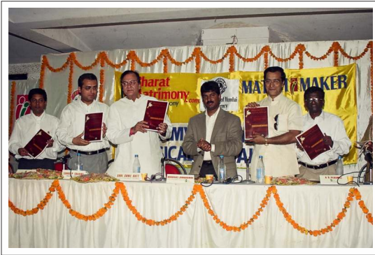
Inauguration of the data booklet for the differently abled persons, through the hands of Member of Parliament and an Movie Actor, Mr. Sunil Dutt.