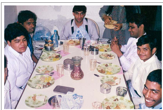
Teaching the Slow Learners how to eat food.