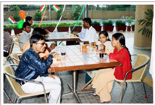
Differently abled having snacks at the function.

On 15th August, 2004, Independence Day was celebrated. 80 under privileged children from the "TASH Foundation" participated.