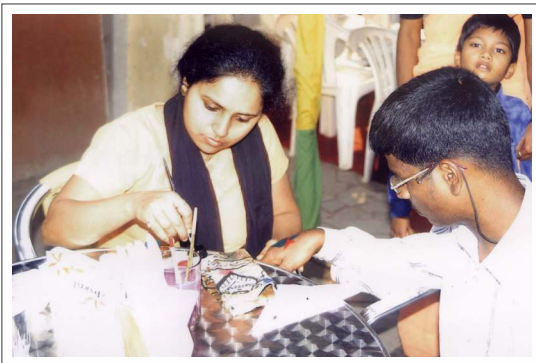
Mehendi and Tatoo being designed on the hands of the Physically Challenged children at the Acres Club.