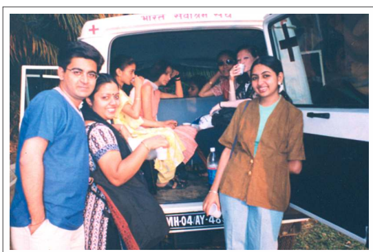
Picnic arranged for Blind students.

The project was Organised on 27th February 2000. This project was conceived with the idea of integrating the abled and the differently abled children together. 25 Children from Sulbha School and Dhanji Devshi School for the Mentally Retarded participated in this programme. The programme involved dance performances and fancy dress items from both the schools. Many such events has been organized after this project.