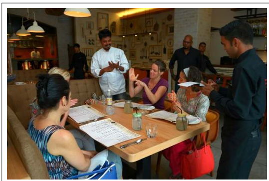
The sign language

My aim is to employ the differently abled and change