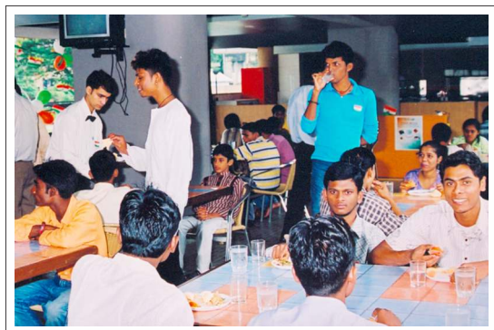
Differently abled Children enjoying snacks at the Republic Day function 2005.