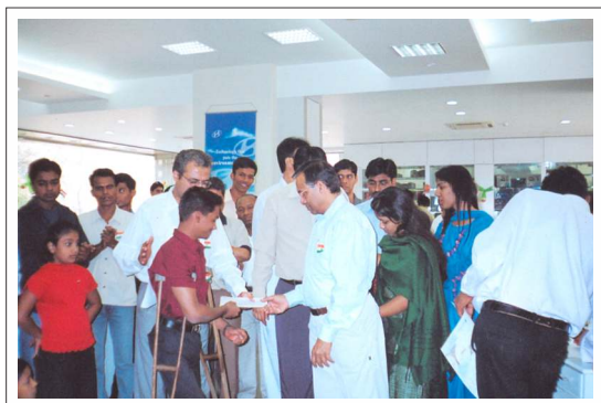
Prize distribution to the winners of the drawing competition held for the disabled, on the Republic day - 2005.