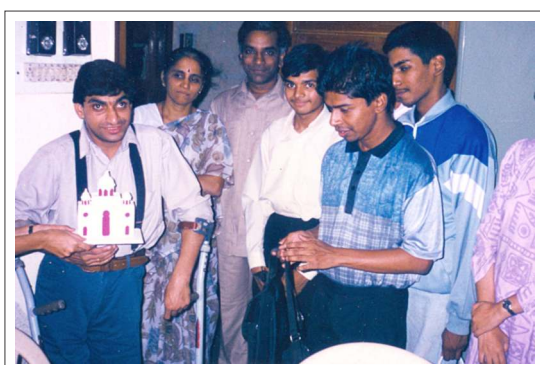
Appreciating Slow Learners for their -----.