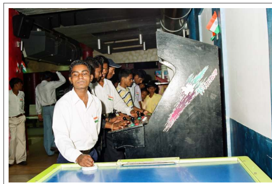
Differently abled having playing-games during the Masti project.

MASTI - A fun filled evening for the Physically Challenged children -