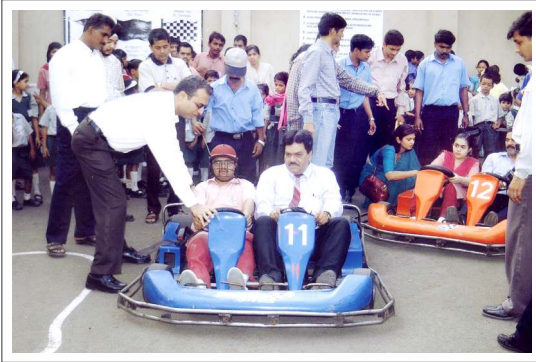
Go-carting for the Physically Challenged children during the MASTI project at the Acres Club.