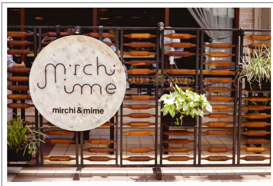
Mirchi and Mime restaurant - Powai, Mumbai