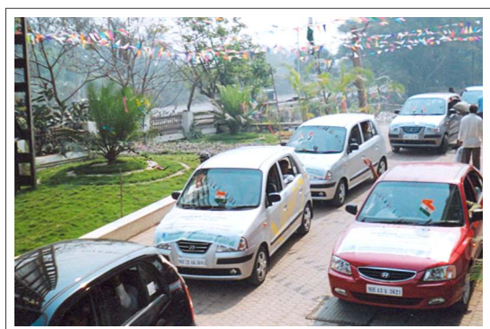
Brand New Hyundai cars used by the disabled children for Mumbai Darshan Republic Day 2005.