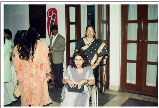
Physically challenged at the Marriage Meet function.