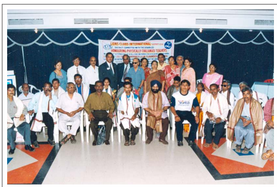
Felicitation of Physically Challenged Teachers.