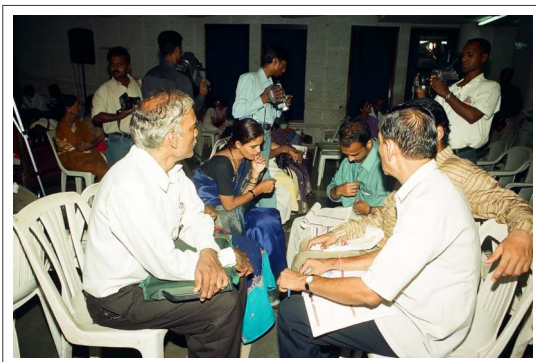
Parents of the Physically challenged discussing with each other at the Marriage Meet function.