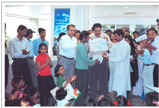
Prize distribution to the winners of the drawing competition held for the disabled, on the Republic day 2005.