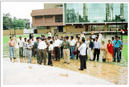
Differently abled gathered for the Independence Day function.

On 26th January 2005, Drawing competition organised for Physically Challenged children, after that the children were shown landmarks of the eastern suburbs in Mumbai with the joy ride in luxury cars and make them feel special on this auspicious day. We used 12 new cars i.e Accent, Santro, Getz, Elantra, etc. This programme was partnered by Phoenix Hyundai Auto Pvt. Ltd.