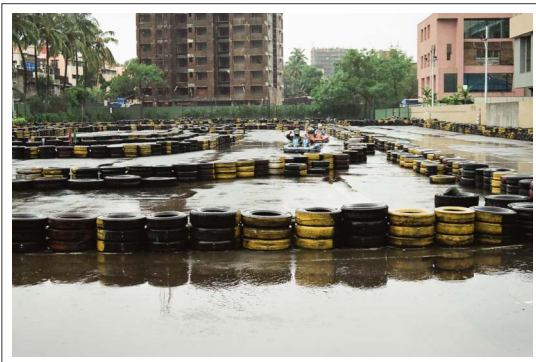
Differently abled enjoying Go-carting during the World Handicapped Day